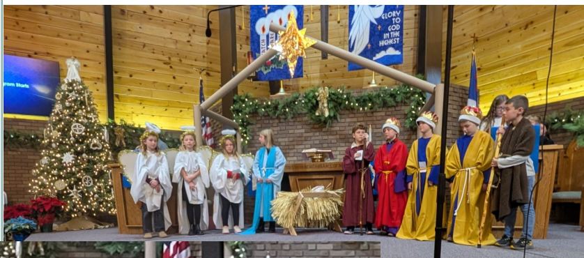
Christmas Program December 15th